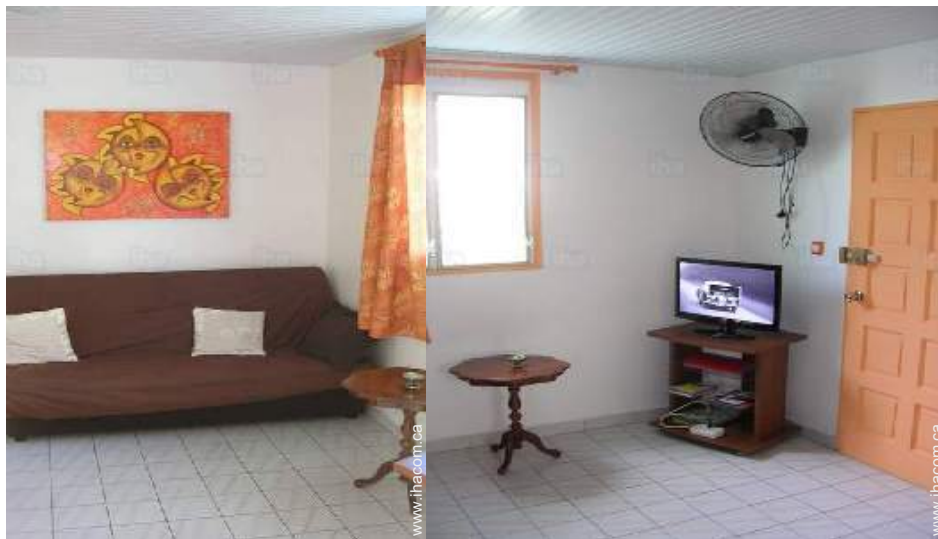
sleeper sofa(s) 2 pers