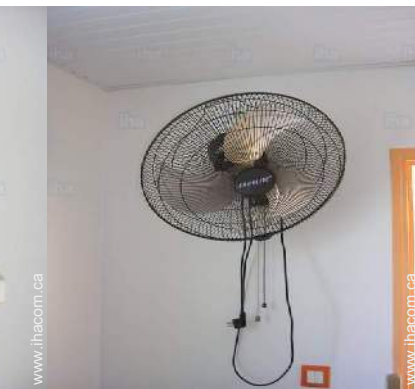
ceiling paddle fan