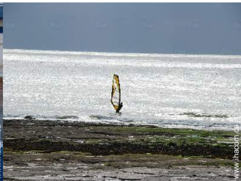
leisure pursuits nearby